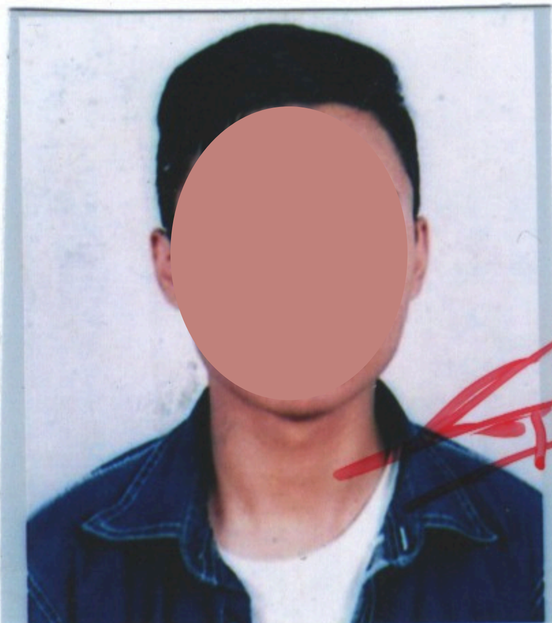
Mr. [REDACTED] Husband(Applicant)

Please feel free to contact us for any queries and further information. The followig photographs depice their respective identity.