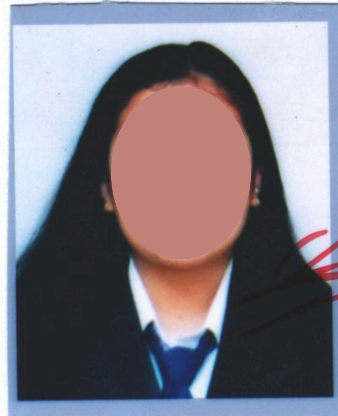
Mrs. [REDACTED] Applicant's wife

[REDACTED] 27 Ward Chairman Lalitpur Metropolitan City